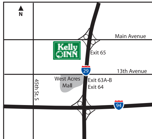
Located off I-29, Exit 65